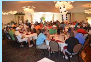
Silent Auction, delicious apps, and a new scratch off game-many enjoyed the after hours on the "19th Hole"!