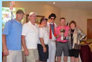
Winners-Lola's Lakehouse-stop by to see "The Cup"!