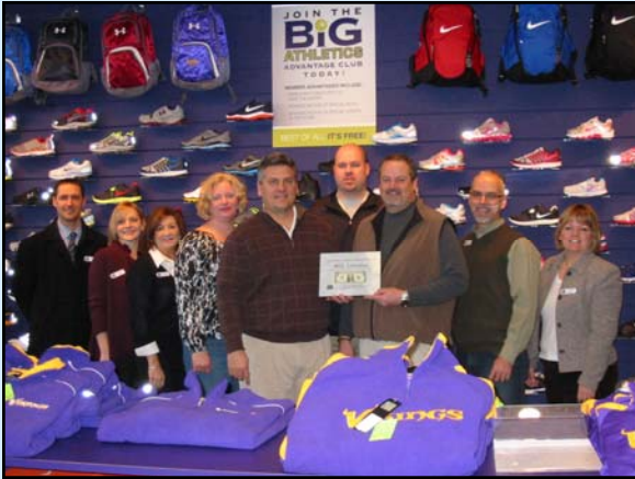
The Ambassadors present BIG Athletics with their First Dollar of clear profit!