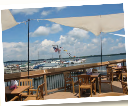
People come from miles around to enjoy Lake Waconia—one of the largest and cleanest lakes in the area.