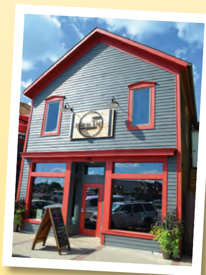
For a glimpse back in time, a memorable adventure, or just a peaceful day, there's no destination like Waconia.

At the Waconia Ice Arena, residents and visitors enjoy open skating, figure skating and hockey. Rental skates are available. Both venues are open to the public.