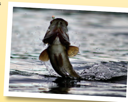
Lake Waconia is a popular fishing lake for good reason. This is where the lunkers live.

Stay and play right here in Waconia! The AmericInn (952-442-8787 or online at www.americinn.com ) and Waconia Inn & Suites (952-442-5147 or online at www.stayinwaconia.com ) welcome you. For retreats, gatherings, etc., contact Cool Breeze Cottage at 612-616-0716 or The Simple Cottage in nearby New Germany (just a 10-minute drive) at 952-855-6088.